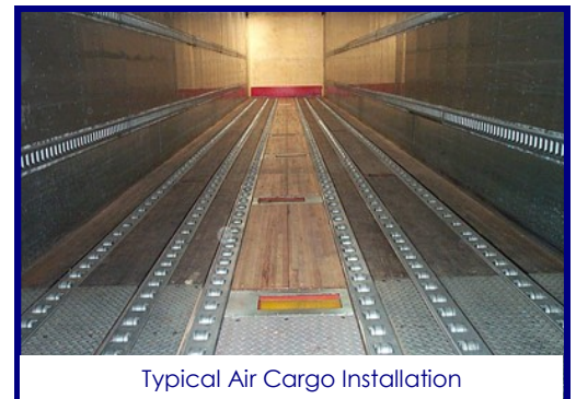
Typical Air Cargo Installation

The Rollerbed Systems Powered Cargo Roller has been designed to maneuver flat based loads within vehicles and warehouse loading bays. The compact design of the roller unit allows it to be fitted flush into the vehicle floor. The Cargo Roller is pneumatically raised and when used with the Rollerbed System's roller track will provide a frictional drive to any flat based load. The urethane roller is driven by the vehicle's own 12 volts electrical system and can be remotely controlled by a tethered pendant or by a hand held infra-red controller.