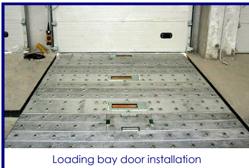
Loading bay door installation

The Cargo Roller can be incorporated into a ball or roller bed dock floor at a loading bay door to facilitate fully or semi-automated vehicle load/off-load in pallet handling areas.